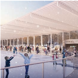
CAPITAL PROJECTS | P.4 IMPROVING THE PARK