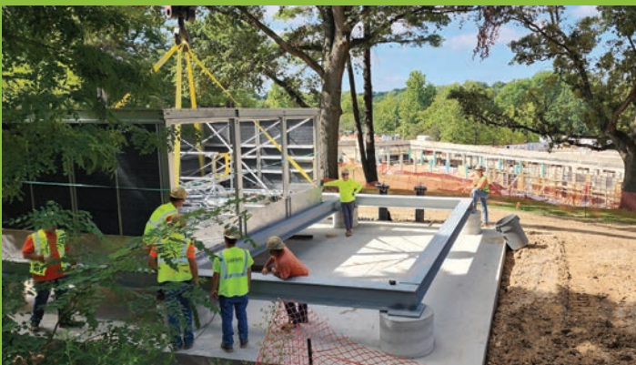
The new chiller unit is installed on the hillside.