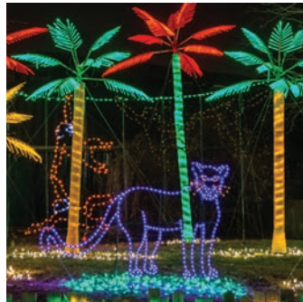
WINTER EVENTS | P.8 ENJOYING THE PARK