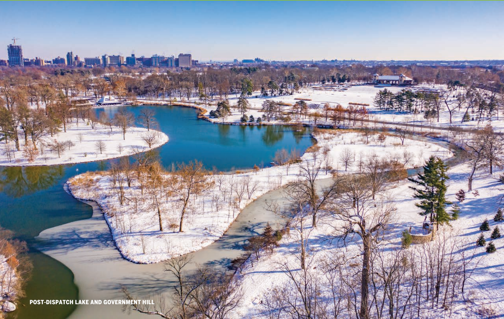
POST-DISPATCH LAKE AND GOVERNMENT HILL