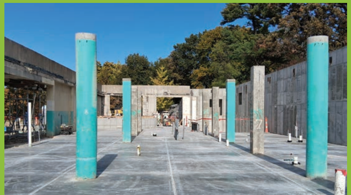
Concrete is poured for the first floor.