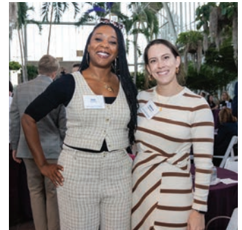
MEMBER EVENTS | P.10 SUSTAINING THE PARK