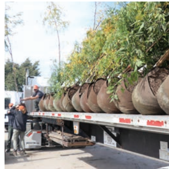
PARK CARE | P.9 MAINTAINING THE PARK